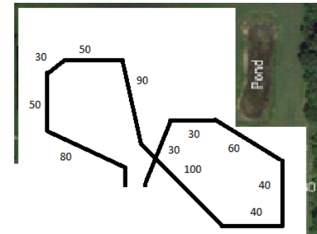
Saturday 600 yds